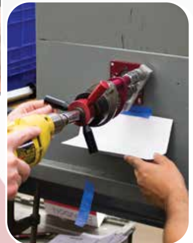
GSA INSPECTOR & TECHNICIAN